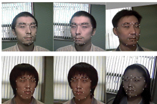
Fig. 4 Localization of facial feature points using AAM and Gabor jet similarity