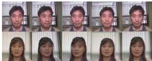
Fig. 2 Some face images of the domestic face database

The domestic face database consists of 515 images of 76 persons with different poses and illuminations. Each image is JPEG with a resolution of 640 \times 480 . Some face images of our domestic face database are shown in Fig. 2.