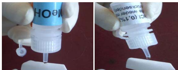
Fig. 2 Application of the fixatives (HCl and MeOH) to the paper filter (based on [12])