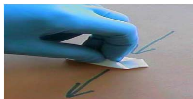
Fig. 3 Exemplification of how to hold the filter in order to clean the surface (based on [12])

After collecting and saving all the samples, they were sent them to the Institute for Occupational, Social and