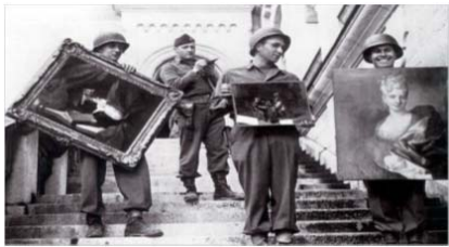
Fig. 4 Move (some or all) of the collections to safer premises [5]