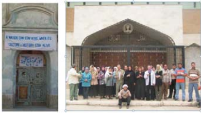
Fig. 3 The first step is close down [5]

The objects may be damaged in transit or as a result of improper storage in the new building, which can place the collection at threat of damage from humidity, pests, and etc. This highlights the importance of a solid contingency plan in which an evacuation is anticipated and planned for. Often, a library, archive or museum has enough space in another location to safely store their collection in case of emergency. In all cases, the mistake is usually made of transmitting materials to surroundings that do not meet the minimum preservation standards [5].