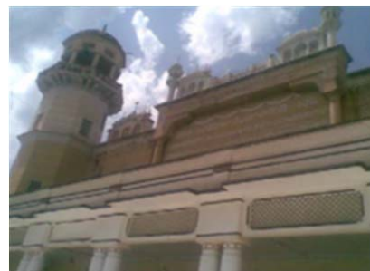
Fig. 8 Intangible heritage affected during the armed conflicts of 2007-2011: the number of visitors to the Grand Shrine in Saidu Sharif has decreased over security fears [8]