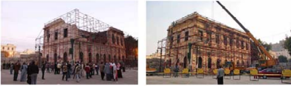
Fig. 16 Reconstruction of the Building Sheikh Sultan Al Qassimi, Governor of the Emirate Of Sharjah