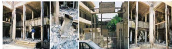
Fig. 12 National Library [4]