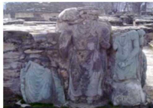
Fig. 7 Butkhara, a historic site next to Swat Museum (Pakistan) containing the unique ruins of Buddha, was partially damaged by shooting during the military operation [8]