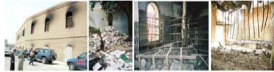
Fig. 10 House of Wisdom, Iraq [4]