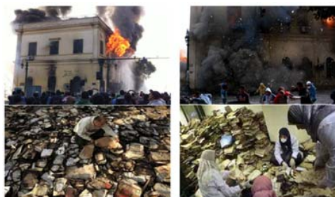
Fig. 15 The Institute was destroyed by fire 17 th December 2011

It was reported incorrectly that the original manuscript of the 20-volume Description de l' Égypte (1809–29) was damaged during the conflicts in 2011 (Fig. 15). Most of the original manuscript material for the description resides in the Paris National Library and National Archives.