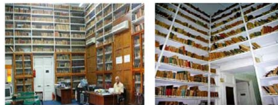
Fig. 14 The huge collection (over 35,000 volumes) of unique and ancient references in the Institute

The Institute financed the work of scholars and technical professionals of the Commission des Sciences et des Arts. On 22 nd November 1799, the Institute decided to collect and publish its scholarly work as the Description of Egypt. The Institute continued till its 47 th and last meeting on 21 st March 1801.