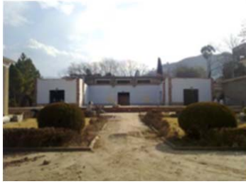
Fig. 9 Ongoing re-building and rehabilitation of Swat Museum by the Italian work [8]