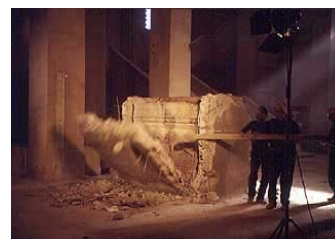
Fig. 5 Beirut National Museum. Rehabilitation after the civil war (1975-1991). Removing the cement box which covers a Roman Sarcophagus [4]

If help is required from or offered by various organizations, fragmentation of assistance can lead to duplicated efforts and a lack of information. To avoid that, heritage institutions that are in danger could be linked up with one foreign heritage partner only. This idea has already been practiced by the American Museum organization and Middle East Librarians organization. The familiar work between Twin and Sister Cities is called twinning [5].