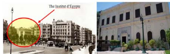
Fig. 13 The Institute of Egypt that is learned academy formed by Napoleon Bonaparte to carry out research during his Egyptian campaign