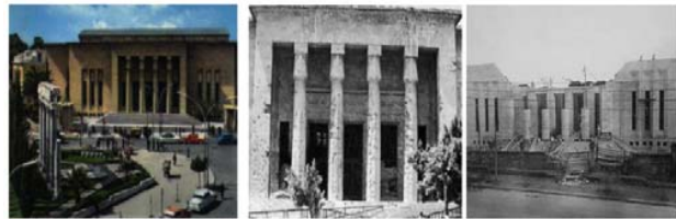
Fig. 6 Beirut National Museum, before/during/after the civil war (1975-1991) [7]

The building of Swat Museum was destroyed partially and showcases were totally destroyed during the conflict. The head of the project and co-director of Istituto Italiano per l’Africa e l’Oriente (IsIAO), has recommended a traditional style of architecture for the reconstruction. In this regard, the cultural park will be a landmark in Swat’s history, and clearly, the archeological sites will be protected there. It will develop tourism and increase public attention about the protection of cultural heritage. Protection should be given to all the adjoining places where archaeological sites stupas are located.