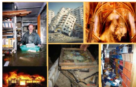
Fig. 2 Potential threats for Heritage cycle [4]