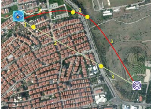
Fig. 3 Risk map for a mixed area