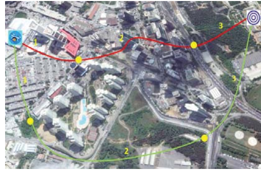
Fig. 2 Risk map for an urban area

The territory for a delivery can be classified in three groups as urban area, mixed area and rural area. We generated a parcel delivery scenario for a specific target address in Fig 2. Two routes are generated for the same target. Red and green paths are segmented in 3 pieces. Red route is shorter but risk factor is higher.