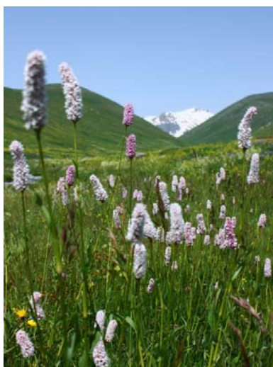
Fig. 3 Bistorta officinalis Delarbree

according to original descriptions differ with color of perianth (bloody pink and pink) and mate and glossy fruits, respectively. After long investigation of herbarium material we came to conclusion, that the fruits are mate when unripe, and in ripe condition they become glossy. Besides, all the flowers of investigated material were pink, which accords to Polygonum bistorta and nowadays is included in genus Bistorta and is renamed to Bistorta officinalis Delarbree (Fig. 3). This species is distributed in all floristic regions of Armenia.