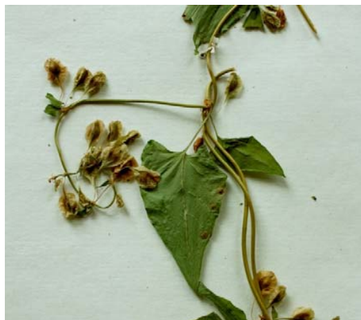
Fig. 5 Fallopia dumetorum (L.) Holub

The genus Persicaria Includes 5 species, previously included in section Persicaria Meisn.: P. amphibia (L.) Gray, P. hydropiper (L.) Spach, P. lapathifolia (L.) Gray. P. maculata Gray and P. minor (Huds.)