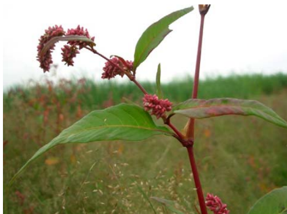
Fig. 6 Persicaria lapathifolia (L.) Gray

Two species, registered in "Flora of Armenia" - Polygonum nodosum Pers. and Polygonum tomentosum Schrank we accept as the same species and include in polymorphic and systematically difficult species Persicaria lapathifolia (L.) Gray. (Fig. 6), which occurs in Lori, Ijev., Apar., Sevan, Yerev., Dar., Zang. and Meghri floristic regions.