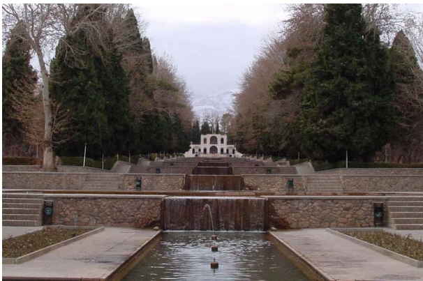
Fig. 2 Main elevation of Shah Zadeh garden, Mahan-Kerman