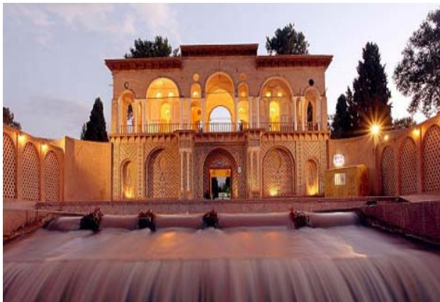
Fig. 1 Main Entrance of Shah Zadeh garden, Mahan-Kerman

Shahzadeh Garden is located at a point 35 km from south-eastern Kerman, and at a point 6 km from Mahan, on the Kerman-Bam Road near the altitudes of Joupar. It is an Iranian garden benefiting from the best natural situation. Shahzadeh garden, Mahan has been constructed in Ghajar Era, at 11-year old sovereignty of Abdolhamid Mirza Naseroldoleh. This garden is located near the tomb of Shah Nematollah Vali on the hillsides of Joupar altitudes. Fertile soil, sufficient sunshine, mild wind, and access to Tigran water had made it possible to construct a garden on that scale on an arid and barren land. Shahzadeh Garden is located on Joupar altitudes in an area of 5.5 hectares, in a rectangular form and slope of about 6.4%. A long fence separates it from the undesirable atmosphere of its peripherals.