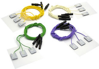
Fig. 1 Gel Electrodes

Surface electromyography (SEMG) provides a non-invasive way of studying muscular function. It is very complex, representing a summation of tissue-filtered signals generated by a number of concurrently active motor units. The generated motor unit action potentials (MUAPs) recorded on the skin surface varies in amplitude, duration and frequency content [1]. SEMG has been used effectively for functional electrical stimulation (FES) or for the controlling of artificial limbs but, its use in clinical diagnosis has been very limited or non-existent [3]. A number of studies have shown that SEMG generated by either voluntary or electrically elicited muscle activity, contain more significant information than it was originally believed [4].