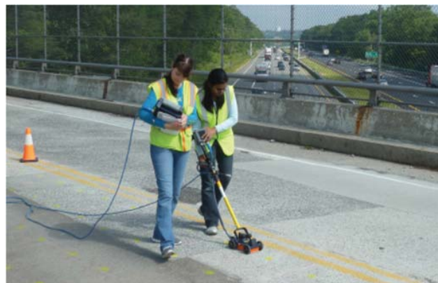
Fig. 2 Picture two of GPR data collection