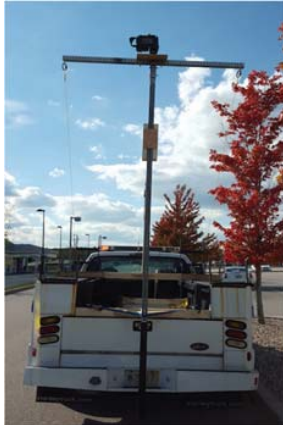
Fig. 4 IR Setup

Infrared thermography works by collecting emitted infrared energy, in the form of temperatures (degrees F), from the surface of the deck using an infrared camera mounted onto a vehicle, about 12-13ft above the surface (Fig. 4). The surface temperatures vary when a delamination is present within the subsurface. Since a delamination is an air pocket, it acts as an insulator for that location of the deck. So as the ambient air temperature rises early in the day, the delaminated area will heat up quicker than an area free from damage and appear as a hot spot.