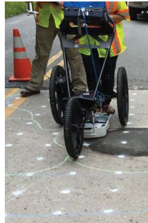
Fig. 1 Picture one of GPR data collection

scale represents the signal amplitude at any given location, and the hyperbolas in the image are the reflections from the reinforcing steel. The peak of each hyperbola is the location used for the evaluation since that is the actual location of the rebar. The left red circle in Fig. 3 is an area that contains potential damage, whereas the right red circle is an area free from deterioration. The difference between these two areas is the ability to clearly see the hyperbola’s peak, in addition to its brightness. This is directly related to the amplitude of the signal at that location. Areas of potential damage have lower amplitudes than those free from damage.