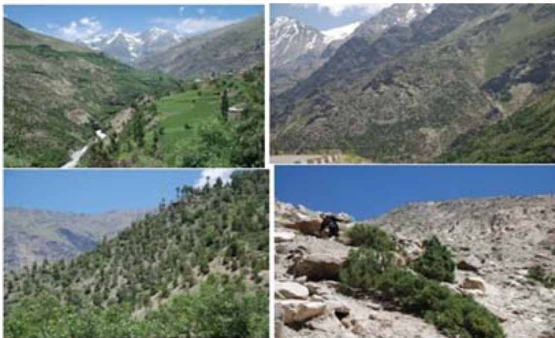
Fig. 3 Study sites of Juniper Forest at Kinnaur and Keylong