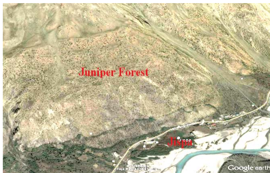
Fig. 1 Google Earth map of the Juniper inhabited area of Lahaul (India)