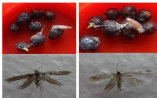
Fig. 4 Infected Juniper seeds and Emerged Lepidoptera Adults

there was no significant effect on seed germination from seed collected from Kinnaur and Lahaul. Seed collected from both location shows similar response to the treatment. Data revealed that Fursa as most effective treatment for Juniper seed germination.