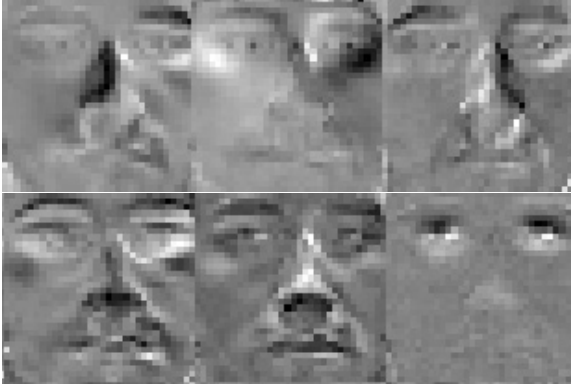
Fig. 5 Example of the first eigenobjects (eigenfaces)

However since the object can move in different directions and its shape can change, we introduce an intelligent forget factor.