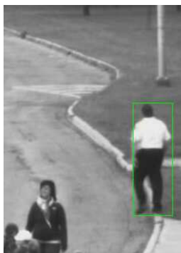
Fig. 2 Pedestrian detection and shape learning.