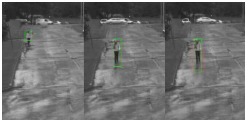
Fig. 11 Results of tracking a pedestrian in rainy conditions