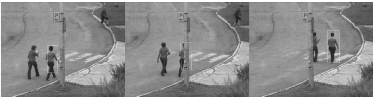
Fig. 10 Results of pedestrian tracking and occlusion handling