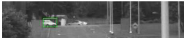
Fig. 1 Detection of a vehicle entering the target detection zone (the first learned shape used in subsequent tracking).

work we start tracking the first object entering the alert zone since only one Pan and Tilt system is used and the camera is moved. It cannot track multiple objects heading in different directions. The extension to multiple targets using multiple Pan and Tilt systems is straight forward.