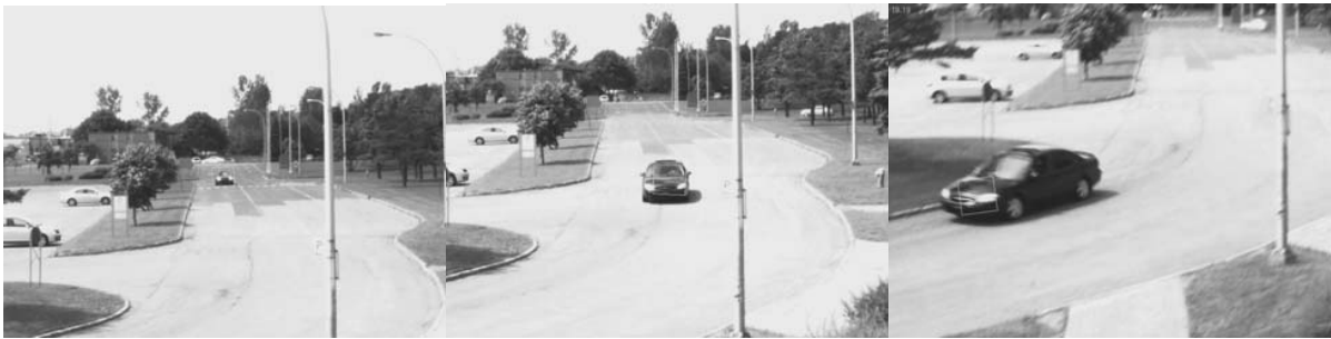
Fig. 9 Results of vehicle tracking