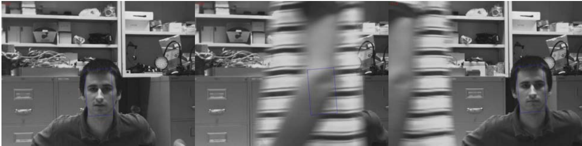
Fig. 8 Results of face tracking under occlusion