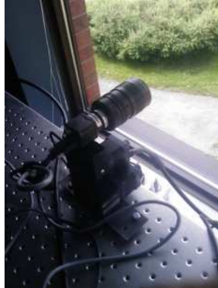
Fig. 6 Pan and Tilt unit PTU-D46-17with a 1024x768 camera

In this work, we need a fast Pan and Tilt system in order to track in real-time fast moving objects like cars. We used an industrial Pan and Tilt system from Directed Perception [12]. The model is a PTU-D46-17 characterized by its high speed: up to 300°/sec and high resolution: 0.01° (Fig. 6).