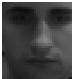
Fig. 4 Detected target in the image (upper image) and mean target image (lower image)

The second approach uses a principal component analysis approach (PCA) for learning and recognition. PCA is a very well known approach for projecting the object in the best eigenspace representing all the learned objects (Fig. 5). It was largely use in face recognition and is known as eigenfaces technique. This approach is used for object recognition. In this work, the PCA is used incrementally on the selected target. Once the target is recognized, it is learned and added to the eigenobjects. The previous computed mean image is used in the learning process.