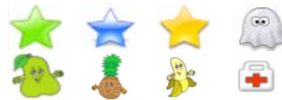
Fig. 2 Magical objects in the "positive personal" category

categories affect the whole team. Fig.2 shows the positive personal magic objects.