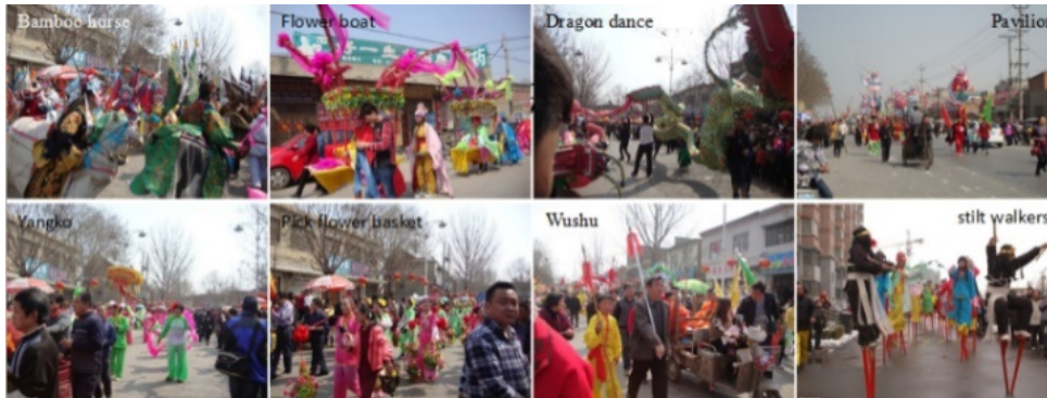
Fig. 3 Fire God Temple Fair

ancient street from this archway, but the height of the archway makes it difficult for the stilts walkers and the pavilions to enter, and the width makes it difficult for the equipment vehicle difficult to follow the performers.