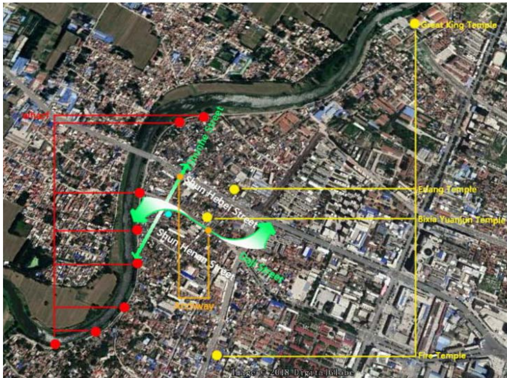
Fig. 2 The composition of the Grand Canal site in Huaxian County