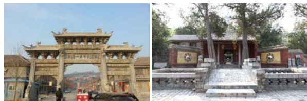
Fig. 10 Mountain Gate and Temple in Dapi Mountain Scenic Area

The Dapi Mountain cultural landscape is divided into East and West mountains by a street, East Mountain is called Dapi Mountain, and West Mountain is called Fuqiu Mountain. It is famous for the stone Buddha which is the earliest in China and largest in north China. The stone Buddha was built in the Northern Wei Dynasty and was excavated by the mountain. It is 26.7 meters high and is hidden in the building with a height of 23.3 meters. There are seven Buddhist temples, eight pavilions, six grottoes, 138 ancient buildings and more than 460 inscriptions existing on the Dapi Mountain. Every year, New year's Eve (Shou sui), the 15 th day of the first month (temple fair), and the 25 th of May (the birthday of Xishan's mother), a large number of believers will come to Dapi Mountain to pray for the protection of the gods. Usually, local residents will come to the mountains for physical exercise and leisure.