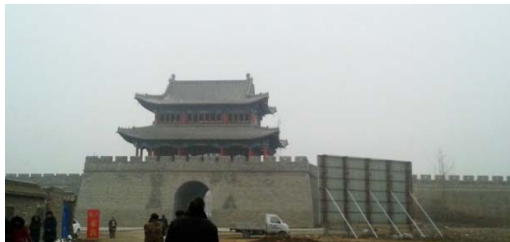
Fig. 9 Ancient City Gate