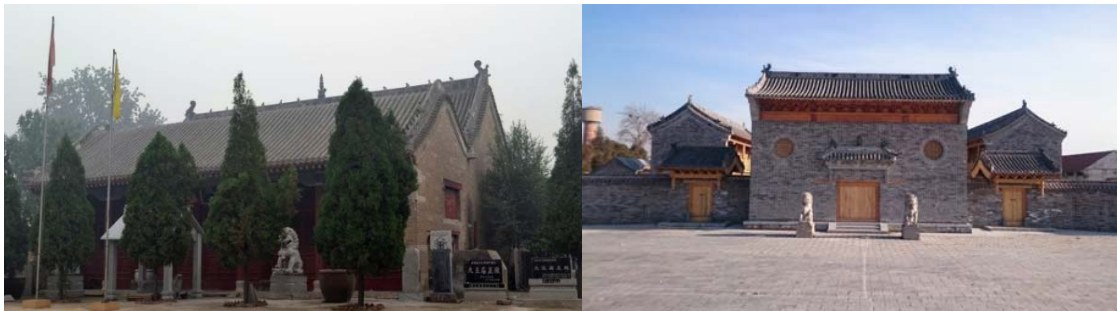
Fig. 6 Before and after the renovation of the “Fire God Temple”

Although the “Fire God Temple” is not located in the protected area, it is the most important temple in the hearts of the Daokou people. Every year, Daokou hosts an ancient folk cultural activity on January 27, 28, and 29, called the “Fire Temple Fair”. In ancient times, in order to avoid fires, people sacrificed the god of fire in this way, expressing the good wishes of the working people to ward off evil and disaster. Although hundreds of years have passed, it is no longer necessary to entertain the gods, but the “Fire Temple” has been preserved as an intangible cultural heritage.