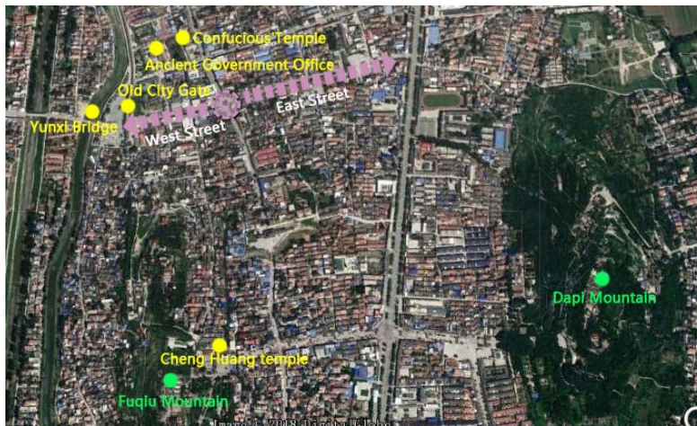
Fig. 7 The composition of the Grand Canal site in Xunxian County