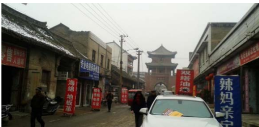
Fig. 8 Ancient Street