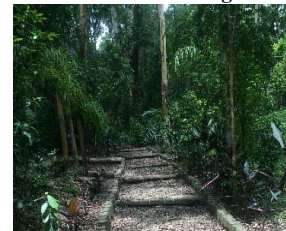
Fig. 2 Types of forest fragments in the Jaguaré watershed.

Fig. 2 shows different examples of green areas in the Jaguaré watershed, such as Evandro Valério Square, which has recreational equipment improvised by the population; the site of the Escola Politécnica Avenue at its intersection with the Raposo Tavares Highway, which was recently planted by the Green and Environmental Secretariat of the São Paulo