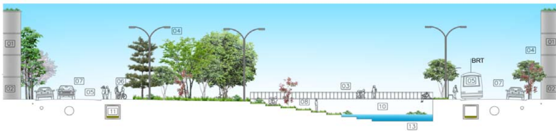
Fig. 5 Typical cut for the proposed blue and green corridors. (1) Multiple use buildings with green roof; (2) Living Ground Floor with commercial units; (3) Crossing bridge for pedestrians; (4) Planting of suitable species; (5) Public transportation; (6) Bike trail; (7) Limitation of the use of individual transport; (8) Roof terrace; (9) Sustainable drainage; (10) Use of phytoremediation species in the watercourse; (11) Sustainable drainage; (12) Health infrastructure; (13) Regularization of the canal bed with sustainable techniques; (14) Adequate lighting to promote nighttime use of structures

Fig. 5 shows a typical cut that could be applied to a blue and green corridor with leisure areas, transportation infrastructure, vegetation requalification, sanitary infrastructure to control water quality, elements of connection between population and area, control of use and occupation to promote the circulation of the population in the area.