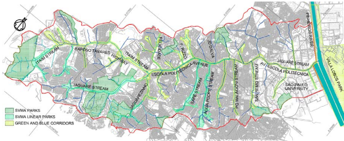
Fig. 4 Blue and green infrastructure proposal.