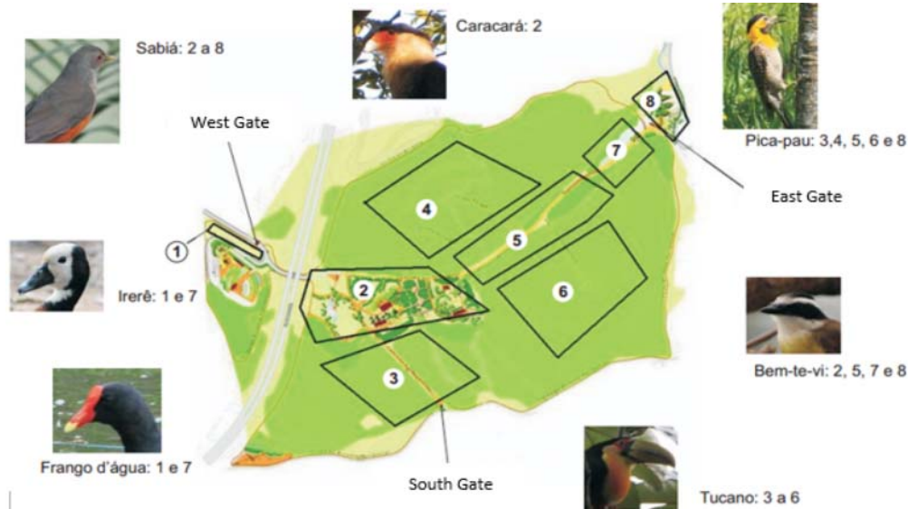
Fig. 7 Birding sites at Tizo Park [8]

swamp chicken (Gallinula chloropus) [8]. Fig. 7 shows the bird sighting points in Tizo Park, according to a survey conducted by SVMA [8]. In the Villa Lobos park, according to [7], 51 species of birds were found, as presented in Table I.