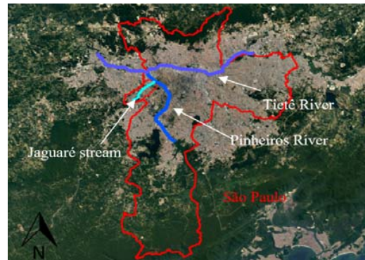
Fig. 1 Jaguaré watershed in São Paulo city.

industrial uses too, due to the proximity to the Raposo Tavares Highway, which is an important connection between the city, the countryside and the southern coast of the state, as well as the south of the country.