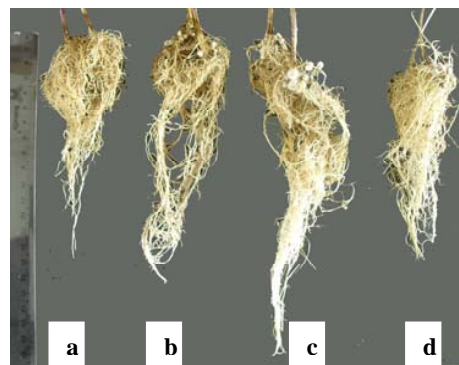
Fig. 3 Treatment of B. japonicum inoculation on the growth of Anjasmoro soybean roots at 35 DAP on Leonard bottle under greenhouse condition. (a) Control (without inoculation), (b) USDA 110, (c) BJ 11 (wt), and (d) BJ 11 (19)

The concentration of IAA on nodules was significantly different with control (Table IV), except on the treatment using Tanggamus soybean (Table IVb). This is presumably due to the complexity of the IAA influence on plant growth. The number of enzymes produced by microbes plays a role in activating of the IAA production, while other enzymes can inhibit its production [12].