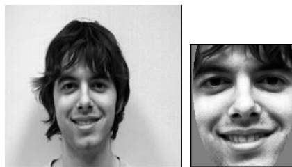
Fig. 2 Face extraction in the visible spectrum.

For face learning and recognition, we extract face regions for further processing. In the visible, NIR and SWIR spectrums, face images are extracted using the alignment technique proposed in [11] (Fig. 2).