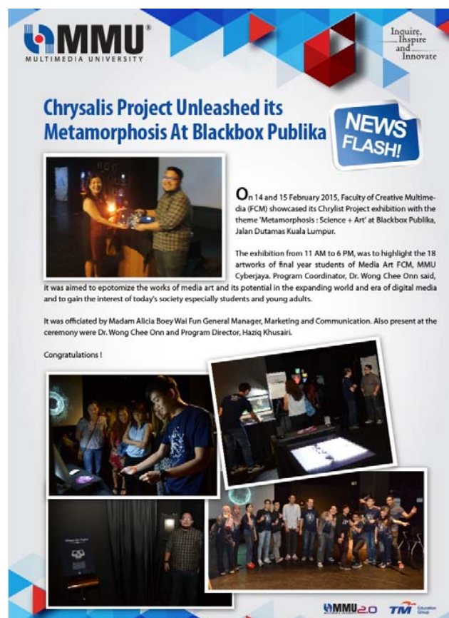
Fig. 4 New on Media Art Exhibition

Fig. 4 shows the media art showcase as one of the event runs by project management students. This event showcases the final year students' project for Media Art students. The students from project management class in Media art specialization were assigned to handle the showcase from planning, invitation, facilities and the overall running of the event. The event was held at Blackbox, Publika and the rental was sponsored by MMU. The students were exposed to task like setting the site for the showcase where they have to decide what facilities needed for each of the project showcasing at Blackbox, Publika at Damansara, Kuala Lumpur, Malaysia.