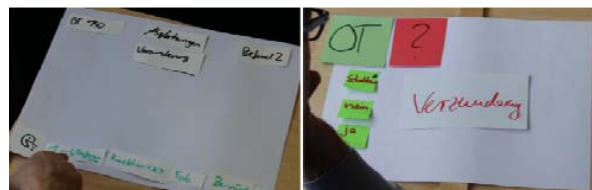
Fig. 2 User interfaces as results from the paper prototyping

In the paper prototyping session, each group designed one interface prototype. These two paper prototypes are displayed in the following Fig. 2.