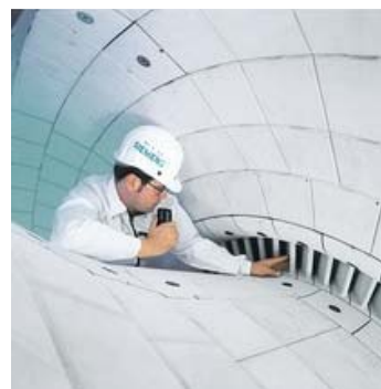
Fig. 1 Inspection of heat tiles in the combustion chamber from Siemens

even the ceramic tiles over time resulting in cracks and sometimes even in tiles breaking into parts. This must be avoided at (almost) all cost since such parts can heavily damage turbine blades that represent the most expensive parts in a gas turbine. Hence, the heat tiles must be inspected on a regular basis and damaged tiles must be replaced before they break. In Fig. 1, an impression of such an inspection is shown.