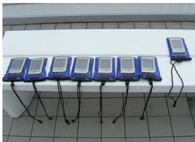
Fig. 1 PDAs used in our class