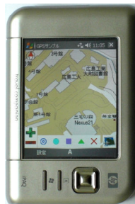
Fig. 2 Campus map