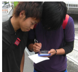
Fig. 3 Campus fieldwork Fig. 4 The scene of operating PDA