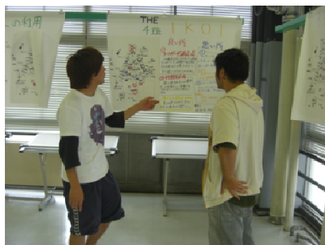
Fig. 5 The scene of their presentation