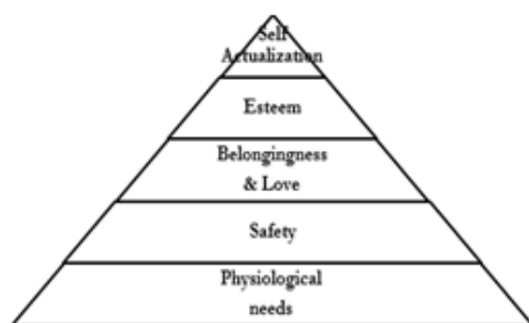
Fig. 1 Maslow model

one's own behavior and feelings, having a freedom of choice, living without inhibitions, being creative and spontaneous, and growing continually by striving to maximize one's potential" [4], [18].