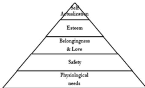
Fig. 1 Maslow model

one's own behavior and feelings, having a freedom of choice, living without inhibitions, being creative and spontaneous, and growing continually by striving to maximize one's potential" [4], [18].