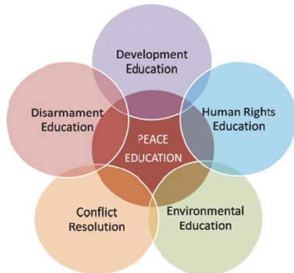
Fig. 3 Framework of Peace Education and its Co-Disciplines

intersections among peace education and environmental education to understand how these commonalities frame education for sustainable development. The authors developed a framework showing that peace education exists with its co-disciplines, namely: development education, disarmament education, human rights education, conflict resolution, and environmental education [4]. The model is shown in Fig. 3.