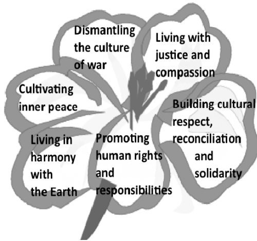
Fig. 1 The Flower Model

respect, reconciliation and solidarity; 5) living in harmony with the earth, and 6) cultivating inner peace [12].