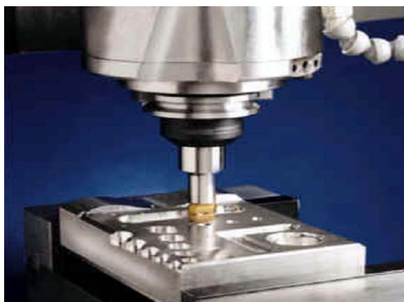
Fig. 1 End Milling Operation on D2 steel

systematic approach that can help to set-up milling operations in comparatively lesser time and also achieve the desired surface roughness quality. Due to high tolerances and good surface finish values that milling can deal, it is ideal for adding precision features to a part whose basic shape has already been formed [4].