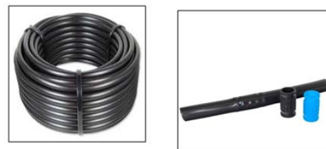
Fig. 1 Drip irrigation pipes

A sample of 20 rolls of drip irrigation pipes; each of 400 meters, are used to evaluate the process. Pipe's thickness (mm) and hardness (Pa) were measured using a digital caliper and Identec hardness machine, respectively. Since the sample size ( n ) is equal to 1, the individual moving range (I-MR) control charts are constructed for thickness and hardness as shown in Fig. 2. Obviously, the control charts indicate that the process is in statistical control for both quality responses. Table I summarizes the parameters; upper control limit (UCL), centerline (CL), and lower control limit (LCL), of the I-MR control charts. The estimated values of means and standard deviation are calculated and are also displayed in Table I.