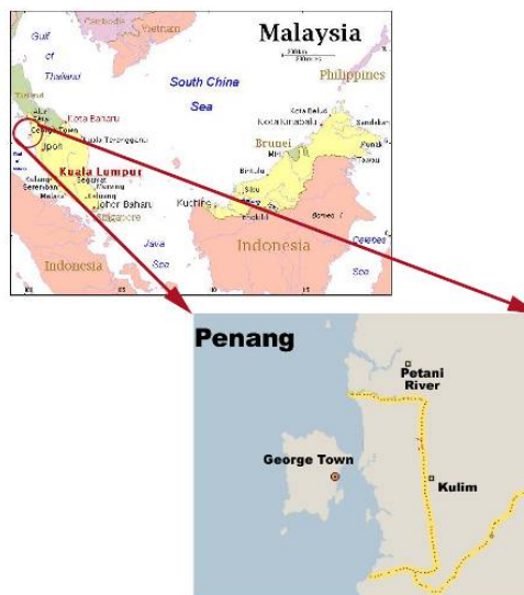
Fig. 1 Study area

The study area is the Penang Island, Malaysia, located within latitudes 5^{\circ} 12' \text{ N} to 5^{\circ} 30' \text{ N} and longitudes 100^{\circ} 09' \text{ E} to 100^{\circ} 26' \text{ E} . The corresponding satellite track for the TM scenes is 128/56. The map of the region is shown in Figure 1. The satellite images were acquired on 5-2-2003, 6-3-02, 15-2-01, 19-3-04 and 17-1-02. The corresponding PM10 measurements were collected simultaneously during the satellite overpasses.