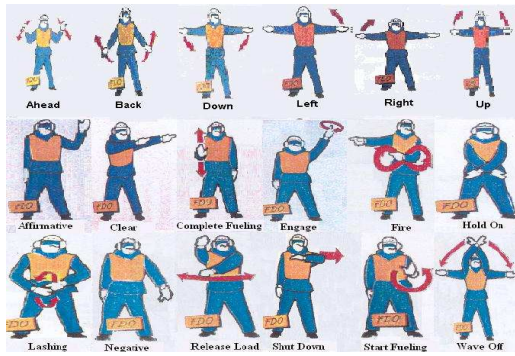
Fig. 2 Static and dynamic FDO gestures

parametric kNN neighbourhood scheme ( k = 1, 2, 3 \dots 10 ) to evaluate the disparity in data sets. Precision/Recall metrics in EROS accommodates proportion of k to the volume (recall) which consists of k number of samples of class of interest. High values of precision (% 100) indicates higher disparity in data set. Further information about EROS can be found in [22].