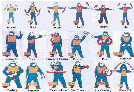
Fig. 2 Static and dynamic FDO gestures

parametric kNN neighbourhood scheme ( k = 1, 2, 3 \dots 10 ) to evaluate the disparity in data sets. Precision/Recall metrics in EROS accommodates proportion of k to the volume (recall) which consists of k number of samples of class of interest. High values of precision (% 100) indicates higher disparity in data set. Further information about EROS can be found in [22].