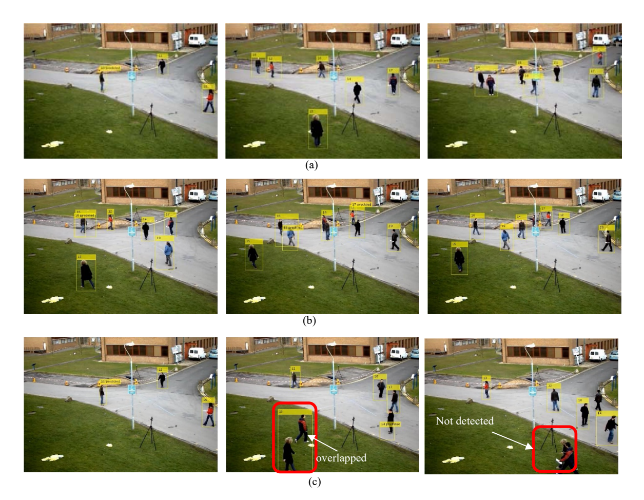
Fig. 3 Experimental results of the Scene2 on the unorganized scene of pedestrians walking in different directions. (a) and (b) Correct detection and tracking. (c) Failure cases happened when pedestrians are moving close to each other