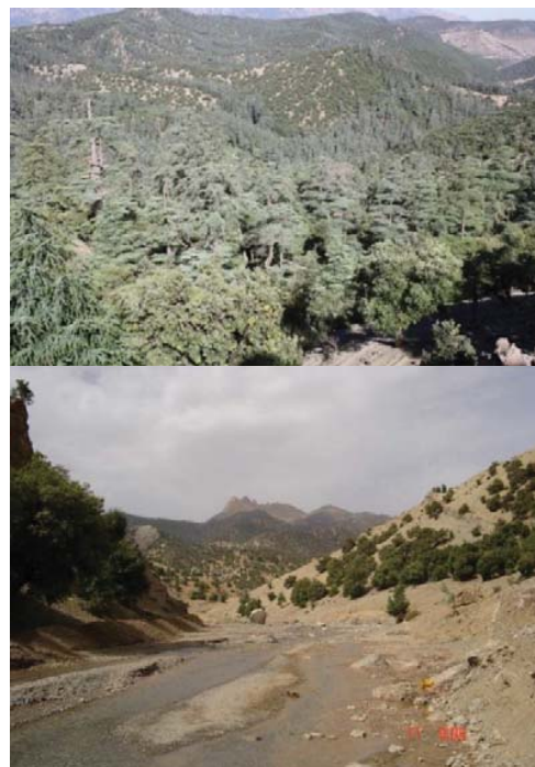
Fig. 1 General view of forest ecosystems in Morocco