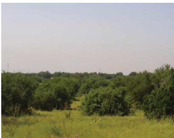
Fig. 3 Biosphere Reserve of Argania spinosa