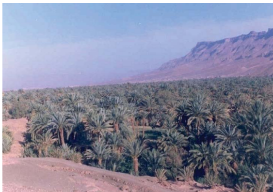
Fig. 4 Biosphere Reserve of Southern Oasis Morocco

The geographical distribution of protected areas [8] covers all regions of the country with a very satisfactory representation of major ecosystems and major habitat types.