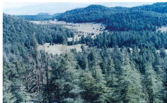
Fig. 6 Biosphere Reserve of cedar ecosystem