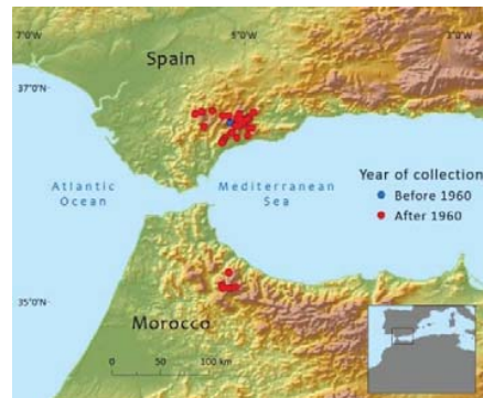
Fig. 5 Intercontinental Mediterranean Biosphere Reserve [8]

The geographical distribution of protected areas [8] covers all regions of the country with a very satisfactory representation of major ecosystems and major habitat types.