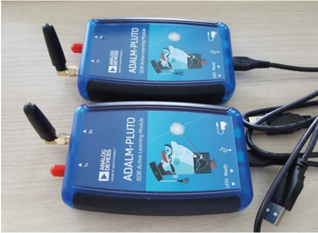
Fig. 1 A photograph of the PlutoSDR units used for our experiments