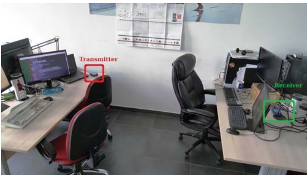
Fig. 2 A photograph of the PlutoSDR units during the measurements