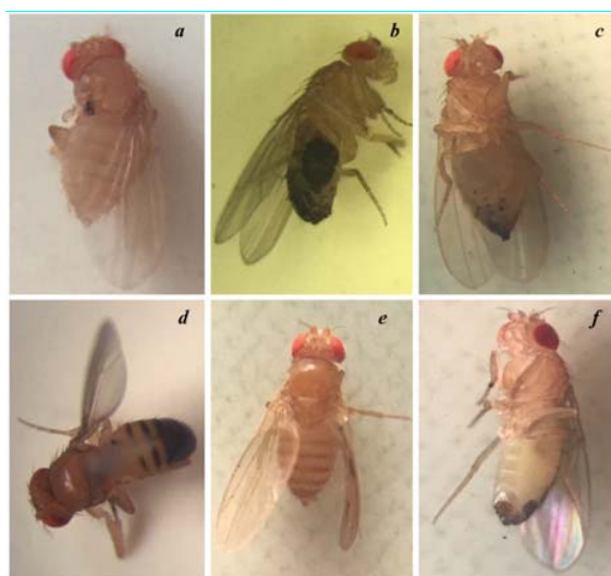
Fig. 2 Morphoses detected in first generation Drosophila melanogaster of the EP-2 test-system: a) morphoses combination - extreme mutant wing phenotype (without a wing), deformation of the head, thorax and abdomen; b) black plaques on a body (melanoma); c) group of small spots (melanomas); d) melanoma and abnormal tergite pattern; e) moderate mutant wing phenotype (improperly outspread wing); f) melanoma

Analysis of the imago with morphoses showed that they have practically no effect on the flies' life activity: they do not interfere with their existence, mating, and even giving birth. In the descendants of the irradiated ones in the next generations ( F_2 and F_3 ), various deformities can often be observed, and all that morphoses astonish with their diversity and depth of disorders that do not affect the viability and breeding of the flies. Under the usual conditions for the cultivation of fruit flies in the absence of stress factors, experimenters may also encounter morphoses, but this happens very rarely [13].