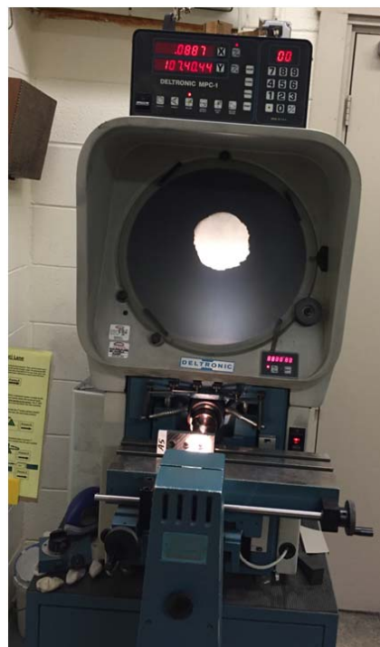
Fig. 1 The projection of a drilled hole as it appeared on the screen of the optical comparator

The process of determining the hole diameter involved selecting three points on the perimeter of the circle. The machine would then indicate the radius of the circle with that high precision.