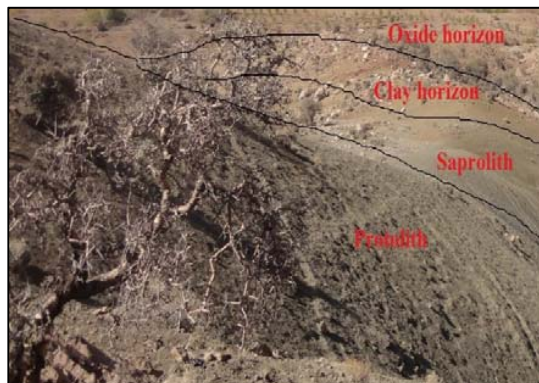
Fig. 2 Different horizons in a vertical profile of the studied laterites in Bavanat region

deep slope. Constituent materials of this zone are soft and incoherent with reddish brown in color. The oxide zone is characterized by massive or colloidal textures including ferruginous concretions of variable diameters ranging from 1 to 5 cm. Silica veinlets in stockworks can be observed in the bottom of this horizon.