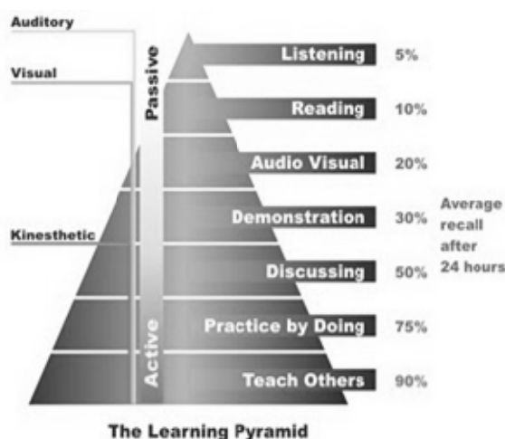
Fig. 2 Learning activities supporting learning retention

Its usefulness enables the learning retention to reach 90%. However, the Cone of Experience by Dale refers to learners while Fig. 2 [25] refers to effect of teaching methods to learning. This figure clarifies that the upper four approaches are deductive while the lower three are inductive. Reference [27] claimed that the retention differences between the deductive and the inductive instruction can be considered from learners' reflection and prudent cognitive process. So, Fig. 2 clearly shows that Discussion, Practice by Doing and Teaching Others help the learning retention rate soar to 50%, 70% and 90%, respectively