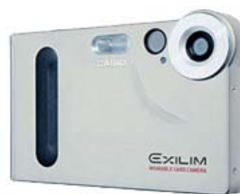
Fig. 3 EX-S1

As mentioned above, while the standard digital camera in 2002 and "EX-S1" were compared, it can easily realize that the features differ greatly. The conventional digital camera had the price range from 20,000 to 50,000 yen, and strong photograph function, such as carrying about 3 mega pixel CCD and 3 times optical zoom. On the other hands, "EX-S1" was sold by more than 30,000 yen, and pursued thin and light body, and quick operation. That is, while "EX-S1" which was the same price range as the existing digital camera strengthens portability and quick reaction, its photograph function was reduced, such as 1.34 mega pixel CCD and a single focus lens.