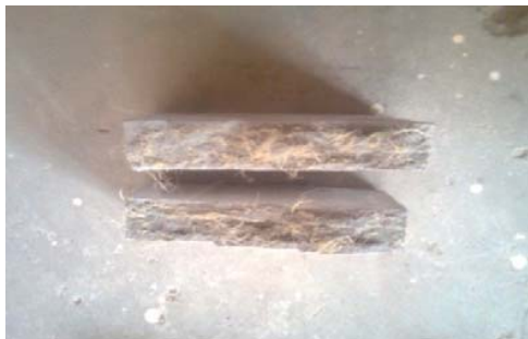
Fig. 4 Sisal fibre reinforced tested slabs (1% fibre)