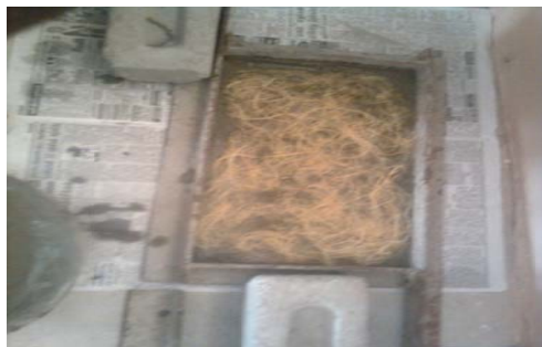
Fig. 2 Hand lay up concrete slab with sisal fibre