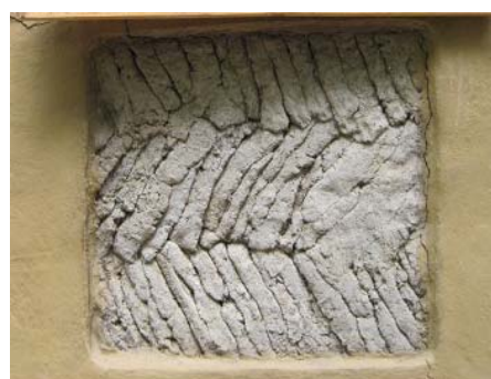
Fig. 10 Adobe and stones were provided walls

Horizontal beams (Oak wood) were installed on the cradles of the walls, also some other beams which called Kalile put in as parallel as the horizontal beams to make roof; Kalile was distribute the stress. As a next step, timbers (Beech wood) were connected to the beams in each 20 or 30 centimeters. Then the crevices among the timber of floor were covered with cob, wild fern and Fal-gel with 8%-10% slope; wild ferns grow abundantly in Masouleh and acting as an insulator