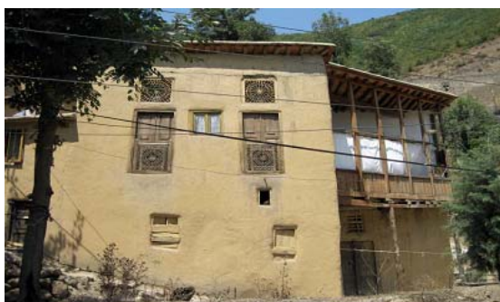
Fig. 7 The sample of Talar Ke house