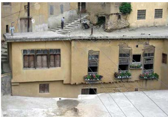
Fig. 6 The sample of Baria Ke house

Also The hall where located behind the rooms or Talar in local language is called SoumeH, which is also the family winter quarter [7].