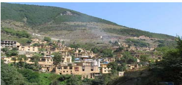
Fig. 15 Old Masouleh and new Masouleh