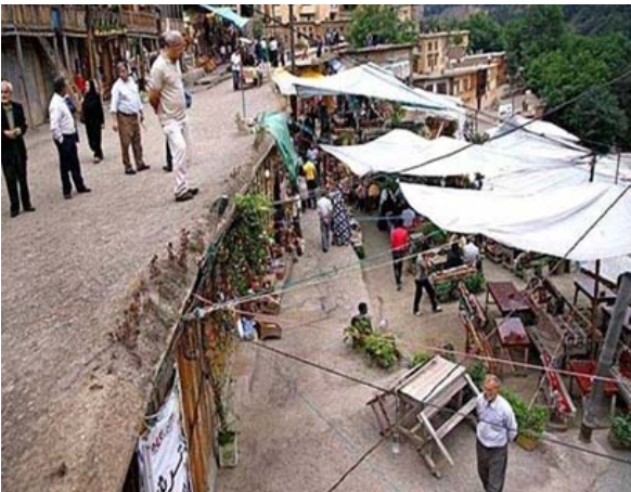
Fig. 4 The main financial part of Masouleh, Bazar

Bazar of Masouleh is seven- storey and there are 120 shops in there (Fig. 4).