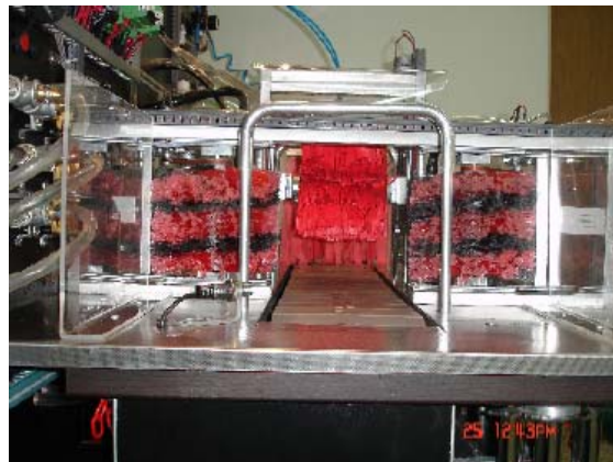
Fig. 1 Stepper motor control

The function of motor can be controlled by PLC according to the number and frequency of pulses and these factors changes. Of course this requires the implementation of specific programs, but for better performance, a special module for stepper motor control in three Forward, Backward and off is designed which is programmable on the base of motor type and can be changed and adjusted easily.