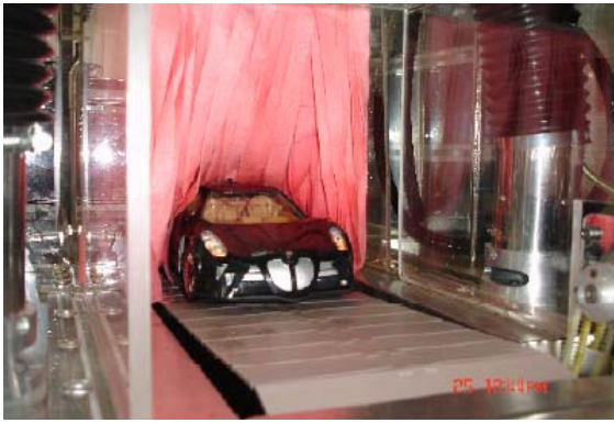
Fig. 3 Washing