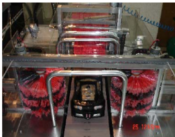
Fig. 2 Sampling of vehicle dimensions

The geometry sampling of vehicle by metering sensors is carried out and data is sent to I/O function unit with two decimal places (Fig. 2). PLC uses these dates to adjust functional program of the device.