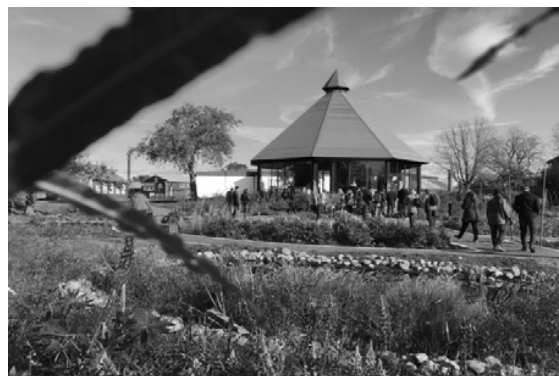
Fig. 1 Orrefors Park in October 2017.

of the landfill in a form of a recreation park. The same idea can be used to remediate and recover the glassworks sites in Småland after excavation by combining the knowledge gathered from the Estonian project and the talents of the glass artists in Sweden to build a phytoremediation tourist glass park in a selected old landfill site in Småland like the Boda glasswork in Emmaboda.