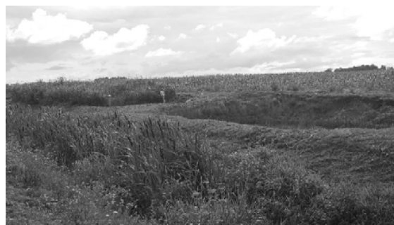
Fig. 3 Subsurface constructed wetland in the farm Mezaciruli, Latvia.

throughout the year by 68% and 53%, respectively, when concentrations at the inlet and outlet were compared.