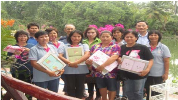
Fig. 7 Ruk Bang Khonti group

We have suggestions in two main aspects which are a policy and a suggestion for the entrepreneurs of the resort in Bang Khonthi district, Samut Songkram. A suggestion regarding the policy for Bang Khonthi district including the whole province of Samut Songkram is that there must be a support for an ecotourism which emphasizes arts, culture, and the beauty of the way of life. Also, the nature must be preserved by raising more awareness of tourists towards its importance to all life on earth. The local people should be encouraged to form a network such as Ruk Bang Khonti group which lets them share opinions and help one another. Eventually, this will lead to a learning process and an experience accumulation. In order to develop the tourism in this particular area, the policy should not be done hurriedly or by comparing with others. The main goal is to let everybody become involve and thoroughly have them experience the most out of the development. Hence, it can be said that living in accordance with the philosophy of sustainable economy is one approach leading to a real strong community as people are always reminded of a cautious life.