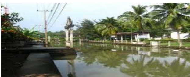
Fig. 2 Environment in Bang Khonthi