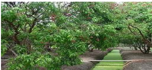
Fig. 4 Agriculture Area