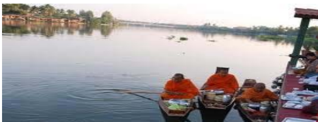
Fig. 3 Morning Culture