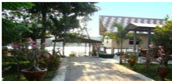
Fig. 5 Lodging in Bang Khonthi