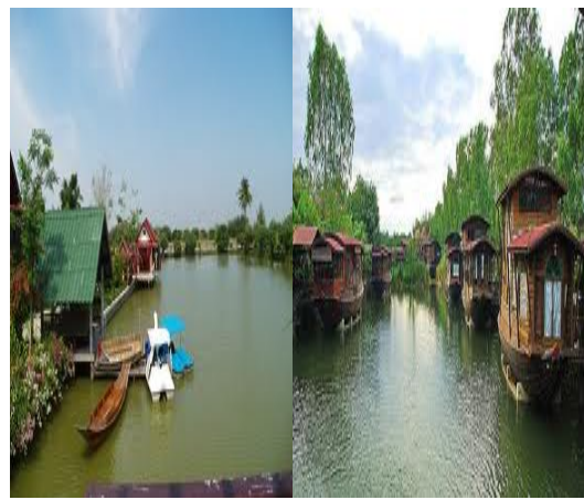
Fig. 6 Lodging in Nakhon Pathom