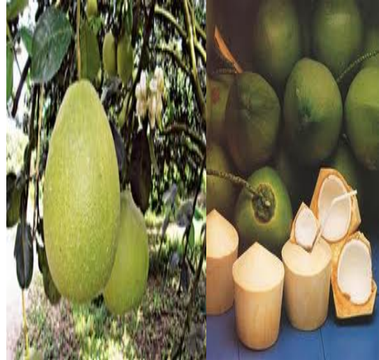
Fig. 5 Pomelo and coconut