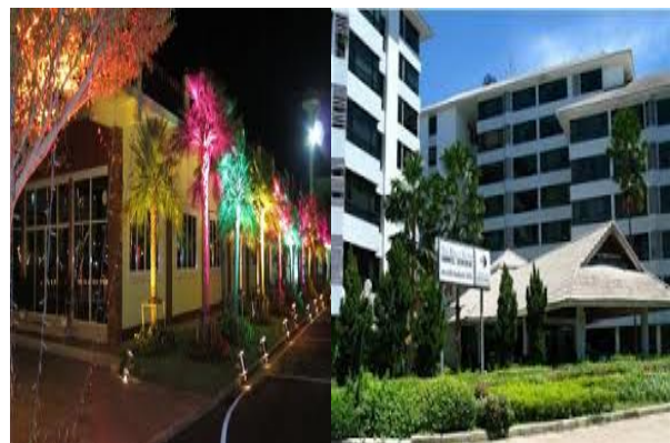
Fig. 7 Lodging in Nakhon Pathom