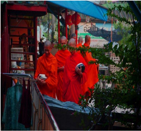
Fig. 3 Morning culture