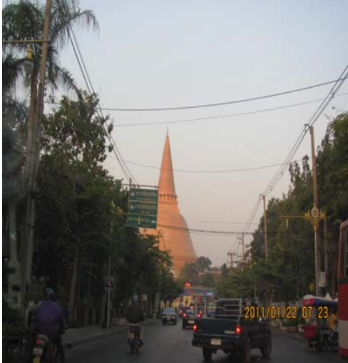
Fig. 2 Environment in Nakhon pathom