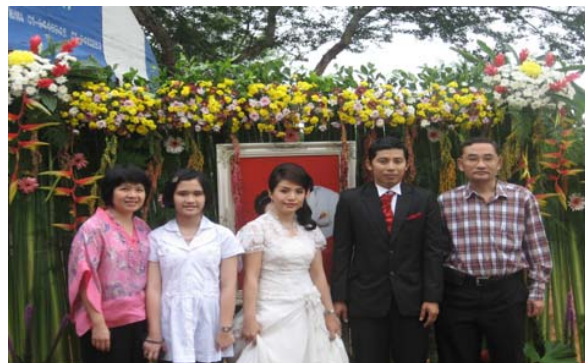
Fig. 9 Wedding ceremony

We have suggestions in two main aspects which are a policy and a suggestion for the entrepreneurs of the resort in Nakhon Pathom. A suggestion regarding the policy for the whole province is that there must be a support for an ecotourism which emphasizes arts, culture, and the beauty of the way of life. Also, the nature must be preserved by raising more awareness of tourists towards its importance to all life on earth. The local people should be encouraged to form a network which lets them share opinions and help one another. Eventually, this will lead to a learning process and an experience accumulation. In order to develop the tourism in this particular area, the policy should not be done hurriedly or by comparing with others. The main goal is to let everybody become involve and thoroughly have them experience the most out of the development. Hence, it can be said that living in accordance with the philosophy of sustainable economy is one approach leading to a real strong community as people are always reminded of a cautious life.