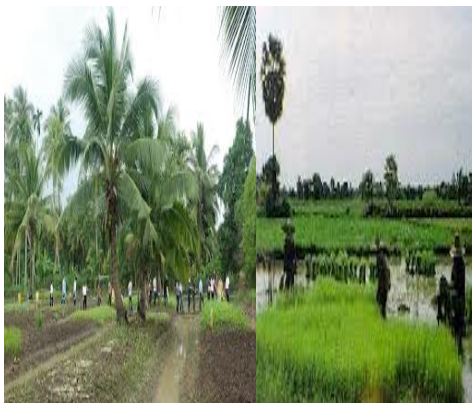
Fig. 4 Agriculture area