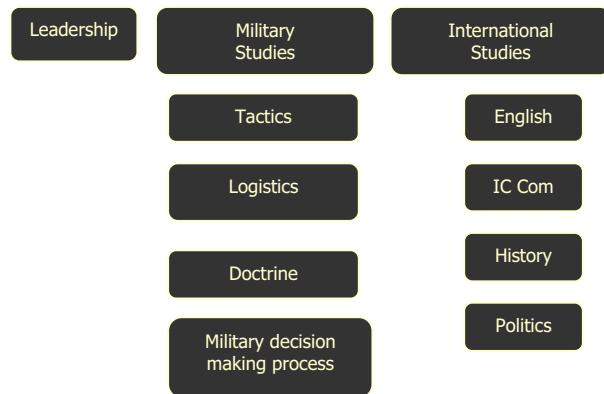
Fig. 1 The organization of the subjects taught at the NMA

The NMA has organized the education within the departments of military studies, international studies and leadership. Fig. 1 displays how the subjects are organized.