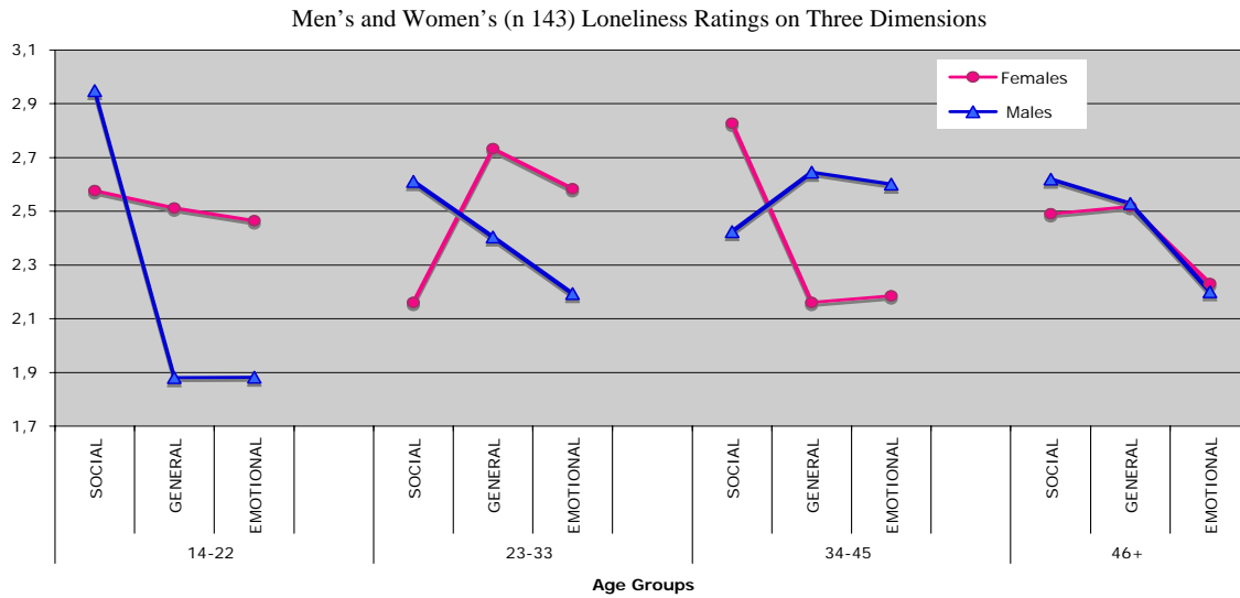
Fig. 1 Mean scores of 3 Loneliness Subscales in Italian respondents, readers of the magazine Focus (Study 2)