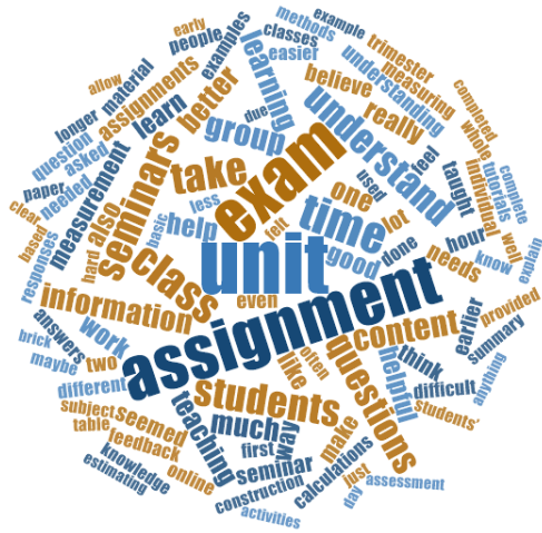
Fig. 12 Word Cloud for Survey data from 2015 to 2019

the students learned some information after submitting an assignment that would have been helpful for the completion of the assignment. Some respondents suggested that the major assignment should be submitted as an individual, not as a group.