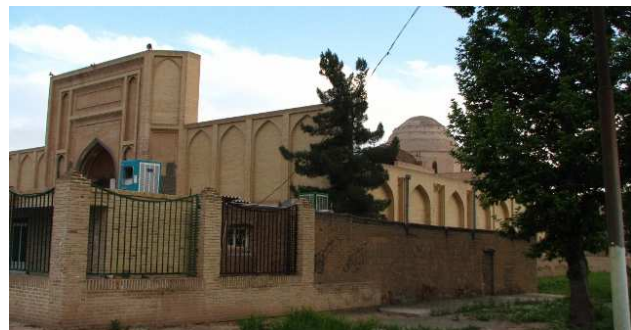
Fig. 11 Chahar Eivani pattern (four varanda), Varamins' Jame mosque, 17 th century

In this regard, Shila Beller and Jonathan Bloom believe that Mongolian conquests were beneficial for Iran when considering architecture and other arts and Iran became a center of cultural and artistic innovation in the Islamic world. Iranian patterns in this era became criteria for evaluating works of art in most of Islamic regions. For example the strong Chahar Eivani pattern (four varanda) became prevalent in Egypt, Morocco and India.