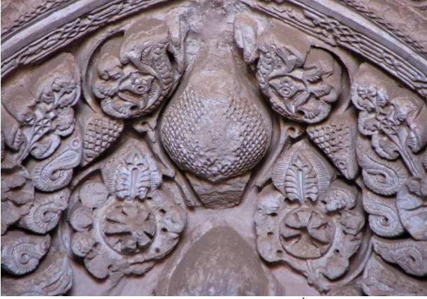
Fig. 8 Floral motif, Naeens' Jame mosque, 10 th century (before impact of Chinese art)

Chinese motifs on Iranian painting, which seems to impress Iranian artists by considering the previous limitations. Paintings from Ilkhanate era show the extent that Iranian painters were affected by Chinese painting. After this era, Iranian paintings advanced significantly and gained its own Iranian identity, which is known as Miniature.