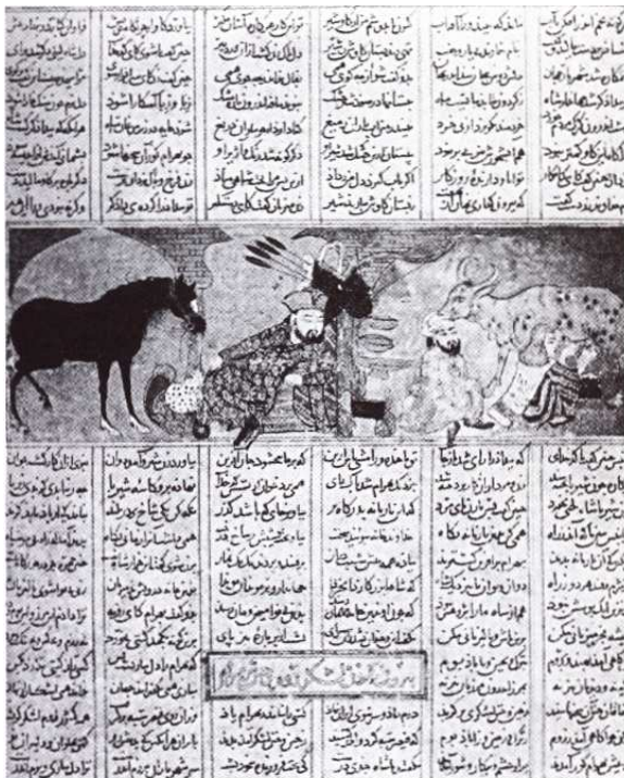
Fig. 5 a Page of Shah Name, 14 th century ,Brooklyn museum[6]

Mongolian rulers' fascination with building decoration and colors and colored decoration is an evident evolution in architectural decoration in Iran. Using colored decorations was also limited in Iran after entering of Islam. 3 Therefore architectural decorations were usually conducted uni-colored (natural color of brick or plaster) in combination with cyan or azure tiles or bricks. 4 But in this era and because of Ilkhanate extensive interest in colored decorations, tile works became prevalent and building decorations departed from being uni-colored or bi-colored. Use of colors changed the environment of architecture in Iran. Gradually the solemn, heavy and artistic decoration of the previous era was replaced by colorful joyful and understandable decorations.