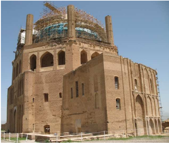
Fig. 3 Oljeitius' tomb in Soltaniyeh

Mongolian tastes in art and architecture clearly were affected by Iranian art and architecture. They employed and supported Iranian architects and artists.