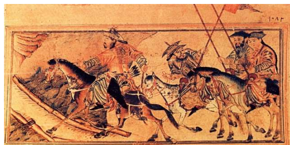
Fig. 7 The paint of Mahmood of Ghazni ,14th century ,Library of Edinburgh University[6]

As mentioned, Mongolians became familiar with Chinese art and culture before Iran and it can be said that the taste of Mongolian rulers was closer to Chinese. Therefore the introduction of Chinese motifs in this era is evident.