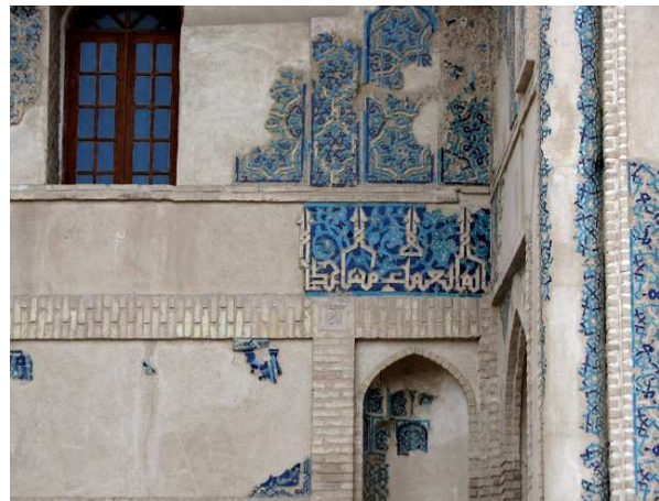
Fig. 6 Decorations of Varamins' Jame mosque

On the other hand, Mongolian rulers were also inspired by the Chinese culture and art; therefore it made its impact on Iranian culture and art. Arthur Pope considers Mongolian impact beneficial for decoration of Iranian decoration and believes that Iran architectural decorations, which had recessed and became cold and dull was resurrected by lively vegetative motifs derived from Chinese art. 5 [2] Of course there are researchers such as Pirnia believe that the decorations of previous era had higher artistic value.