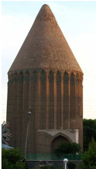
Fig. 2 Boji-e-Toghrol, A Ilkhanate tomb, 14 th century

On the other hand, what transpired in this era also clearly affected Mongolian rulers by Iranian culture and civilization. These changes are an example of complex cultural evolutions made in both conqueror and conquered nations.