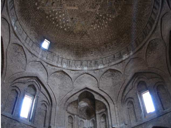
Fig. 1 A sample of Iranian architecture before Mongols' conquest, Dome of Taj-ol-Molk, Isfahans' Jame mosque, 11 th century

This invasion was triggered by a local ruler of Iran who unknowingly, and unwittingly, killed Mongolian traders and was ended by fall of Ismailian castles and conquest of Baghdad by Hulagu Khan. Sack of Baghdad meant the fall of Abbasid Caliphate and as the seat of Islamic power, this event had unprecedented effects throughout Islamic countries. Hulagu Khan was the founder of Mongolian Ilkhanate dynasty (1265-1335 A.C.) in Iran. Ilkhanate also brought sections of current Anatoly, Iraq and Afghanistan under their rule. The first Mongolian rulers in Iran were affiliated with the great Mongolian ruler in China, but gradually the Mongolian Ilkhanate in Iran became an independent government.