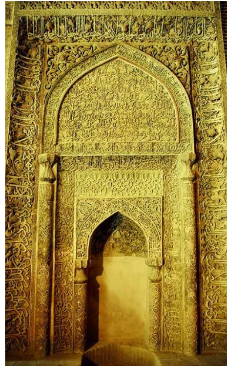
Fig. 10 Oljeitus' Mihrab, Isfahans' Jame mosque, 7 th century

addition to capable artists has always been a source of valuable works of art and science if favorable and safe conditions were provided. During Ilkhanate era the main concern of Iranian society was Mongolian sovereignty and alien rulers. But though supports of Mongolian rulers it became a flourishing era for art and architecture of Iran.