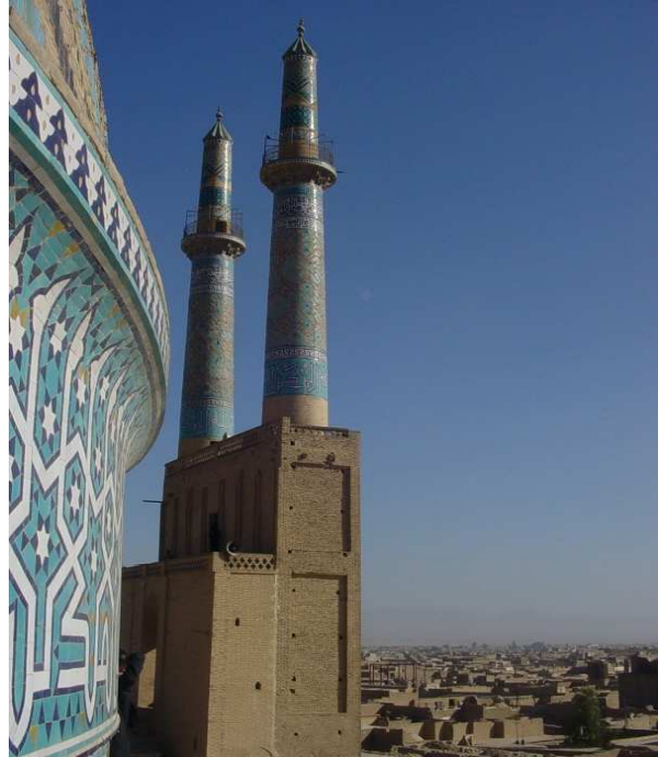
Fig. 4 Yazds' Jame mosque

Mongolian rulers were greatly ambitious, a fact that can be seen in their military conquests. Such ambitious spirit made them interest in great and magnificent buildings remaining from ancient Persian kings of pre-Islam Iran. Abaqa Khan had a great interest in Takht-e Soleyman and this great complex remaining from Sassanid era (224-651 A.C.) –the mighty Persian Empire which became extinct upon Arab invasion– was reconstructed and used by Mongolian rulers. Mongolian rulers' inclination towards grandeur affected the Iranian architectural works of this era and great high rising buildings became a hallmark of architecture in this era.