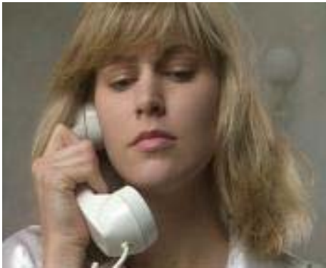
Fig. 2 A scene of "Suzie" video that is used

The performance of the proposed algorithm for collusion attack was verified on a video sequence. A video sequence containing 150 frames is considered. Here, we use 'Suzie' video for test. SS-N watermarking system is used for embedding N watermarks randomly in each frame of video. We use N=3 different watermark patterns with global embedding strength \alpha = 3 for embedding watermarks. For start of attack, at first P successive frame should be selected from static part of video, P=12 successive frames are chosen from static scene of video. For this purpose, 12 frames from first part of video that is static enough are selected.