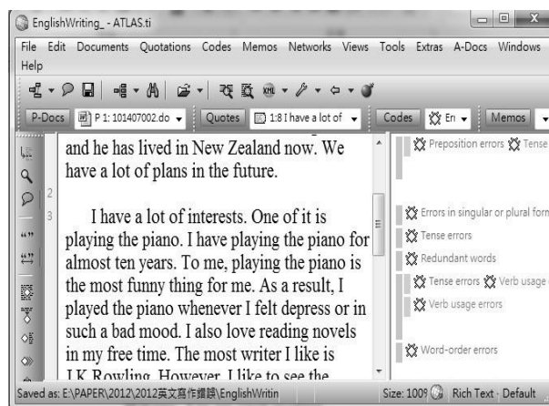
Fig. 2 Coding the errors with ATLAS.ti

In order to classify the various errors in students' composition; also to train students to learn and familiarize the strategies to review and assess their peer's English writing, ATLAST.ti software is used to code and group the errors. Fig. 2 shows an example of coding the errors with ATLAS.ti.