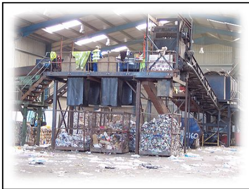
Fig. 3 Bales of crushed plastics ready for transport to the process