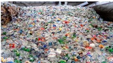
Fig. 2 Bales of crushed plastics ready for transport to the smelter