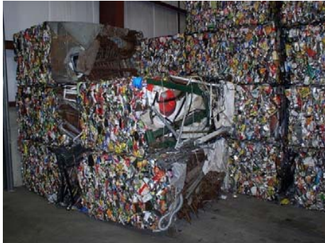
Fig. 1 Bales of crushed steel ready for transport to the smelter

recycling [6], Levels of metals recycling are generally low. In 2010, the International Resource Panel, hosted by the United Nations Environment Programme (UNEP) published reports on metal stocks that exist within society [7] and their recycling rates [8].