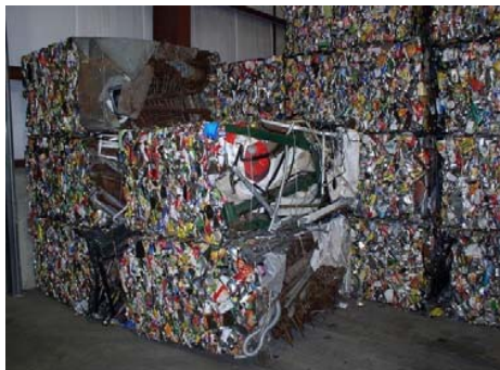
Fig. 1 Bales of crushed steel ready for transport to the smelter

recycling [6], Levels of metals recycling are generally low. In 2010, the International Resource Panel, hosted by the United Nations Environment Programme (UNEP) published reports on metal stocks that exist within society [7] and their recycling rates [8].