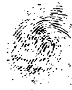
Fig. 6 the image thinned by morphology

To obtain the minutiae, first the grooves should be thinned. This is done by morphology.