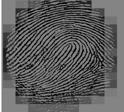
Fig. 1 image after application of Fourier transforms

\text{imgEnhancedBlock} = \text{Hsteq}(\text{IFFT2}(F \times \text{factor}))