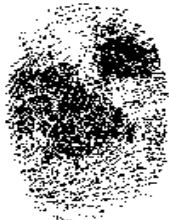
Fig. 4 directional image of fingerprint