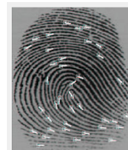
Fig. 8 finding fingerprint minutiae

3- If the ratio is less than or equal with the threshold value, both fingerprints are considered identical.