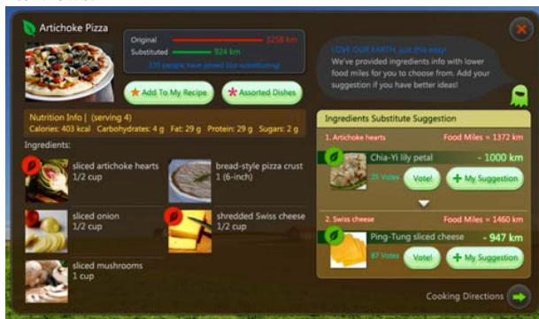
Fig. 3 Recipe of low food-mile ingredients

At this phase, we established the flow model in order to identify the network between meal preparation and material purchase, and define efficiency-oriented type of persona as the recruit target of primary user. The participants included seven mid-class housewives who were the deciders of their daily household purchases. Every participant cooks at home, and does grocery shopping once or twice a week. We provided 200 NTD for each interviewed participant as the rewards. We interviewed three participants. We defined task activities, and made the participants proceed the paper prototyping based on the primary project of the wireframe, in order to identify that the if the sustainable concept delivered through the platform is proper or not, and if it is conform the anticipation of the users. In addition, we adjusted the design based on the result of the interviews.