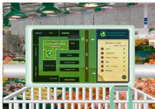
Fig. 5 Screen showing dynamic map of store and indicating the low food mile ingredient zone