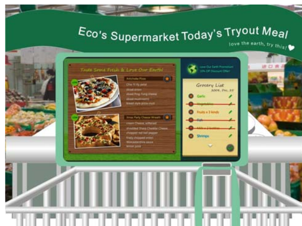
Fig. 4 Screen showing low food-mile try-out dishes

The second phase is to integrate design into the primary platform scheme, present the image with computer, and add the scenario instructions so that the users would have the simulated experience of the utilization of the platform. In addition, we also interview the users about their feelings on the different technologies in the content of the platform. We interviewed four participants, and each participant has received the introduction of the platform concept, scenario instruction, and the process of two major task procedures. Researchers briefly described the concepts and gave directions to the participants, allowed the participants to decide the operation steps. In the experiment they can express their feelings about the technologies and elements in the platform. After the task is done, the researcher would re-interview the participants on their overall feelings about the platform.