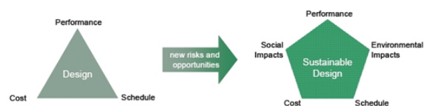
Fig. 2 The shift to Sustainable design