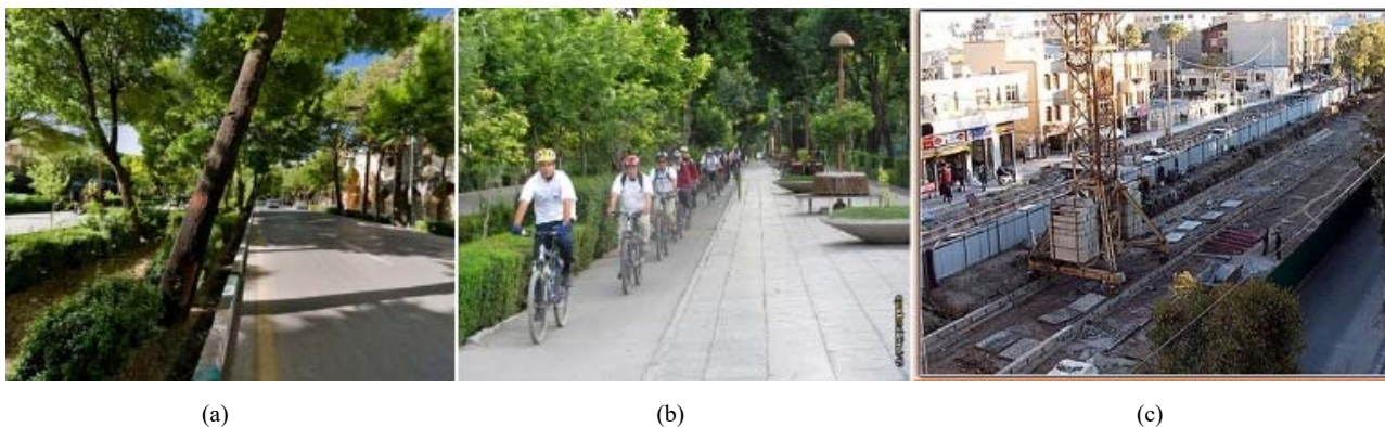
Fig. 7 (a) Vehicle path (b) Bike and pedestrian path (c) Subway construction, [30]

Chaharbagh Street has been known as a multifunctional street specially used as shopping and entertainment space. Multifunction of street has made this it live street in 24 hours of 7 days. Also existence of historical and monumental buildings in this street present the space as an identifiable street which is memorable for users even the once visiting. Façade of the street made by this building has unity along the street, even they were for a different historical period. The height level of the buildings is average between 1 to 3 stories