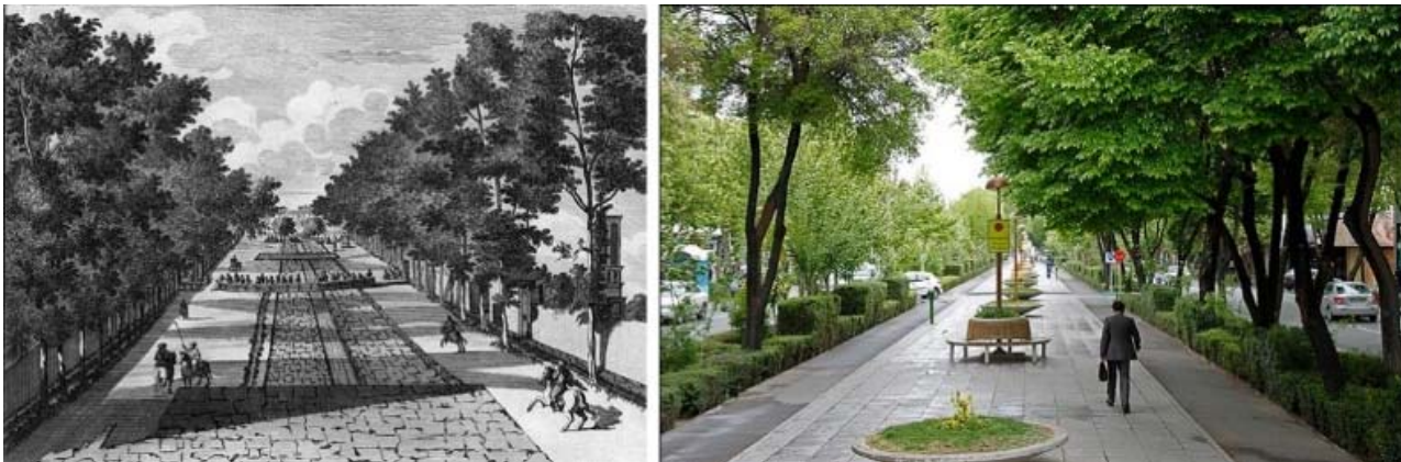
Fig. 5 Chaharbagh Street past and currently conditions [29]

As mentioned before, Chaharbagh Street is one of the historical and important streets in Isfahan. Isfahan is located in the Zagros foothills. The climate of the city is long hot-dry summer and cold-dry in winter. Chaharbagh Street, whose names come from Four Garden, has been designed based on Persian Gardens to make balance between hard climate and human thermal comfort condition. The street continues by a mild slope toward the Zayandeh Rood River. In Safavied period, there was a stream at the middle of the street. Unfortunately, later the stream was blocked and lost its positive effects on the environment (Fig. 5).