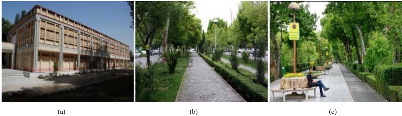
Fig. 8 (a) Renovated facade of Chaharbagh Street (b) New development section of Chaharbagh Street (Southern part) (c) Street furniture

Chahrabagh Abbasi and Chaharbagh Paean (Lower) have a same and simple landscape design which clarified the vehicle path in parallel by pedestrian path that made a place in accordance with human thermal comfort for users. But the in pedestrian path of Chaharbagh Bala (southern part) which is more newly developed part by different building characteristics, designers made some changing in design to create different and attractive place for users (Fig. 8 (b)).