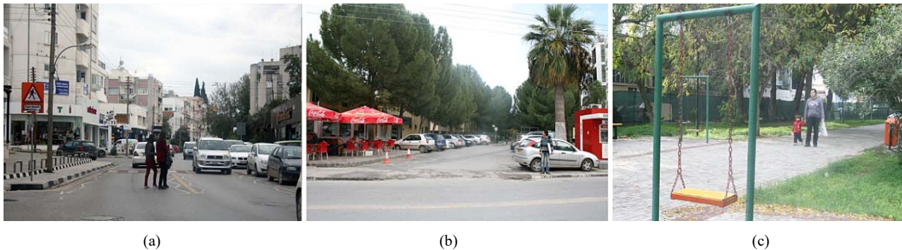
Fig. 3 (a) Pedestrian and cars in conflict (b) Entrance of park as a parking lot (c) Park as a pleasant pedestrian path, and lack of functions around it

fences, and the entrance of the park is occupied by cars. Also, there is no significant landmark exists in the street in order to use for orientation. (Figs. 3 (b), (c))