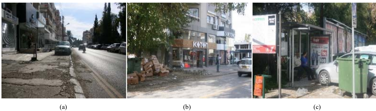
Fig. 4 (a) Pedestrian quality (b) cleanliness of the street (c) street furniture and bus stop location, cars blocked pedestrian path

The functions of street include; shops, restaurant, offices, residential, hotels and other facilities. Organization of functions is random through the street, and relationships between the residential parts and other functions are weak. The street is not serving the daily needs of the nearby residents; due to this fact, local people who can access the street by walk do not use the street efficiently. Despite this weakness, the street seems to be attractive for the public in terms of 'brand shops', 'restaurants', 'cafes', 'banks', and 'offices'. The facade of the street is covered by different types of buildings in different height levels between 1 and 6 stories. There is no unity among them in terms of facade, height, material, etc. (Fig. 3 (a))