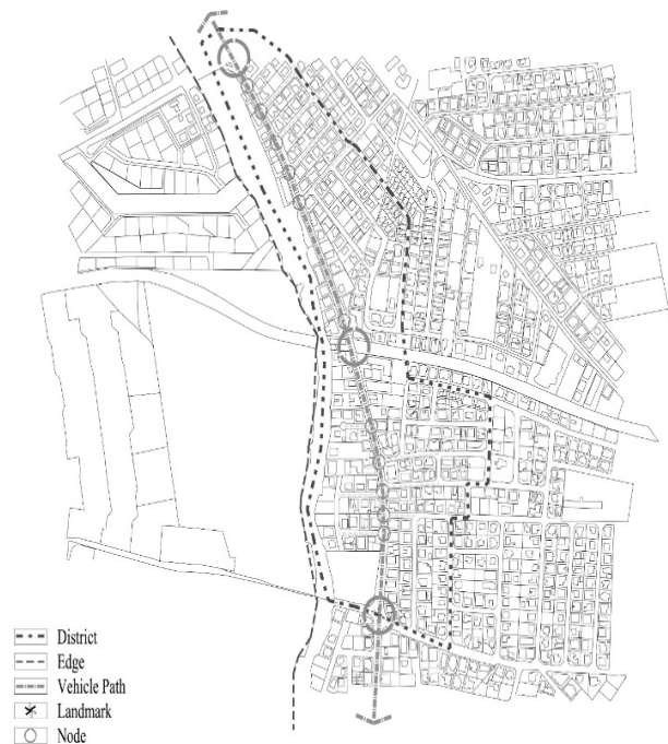
Fig. 2 Lynch Analysis of Dereboyu Street, Lefkosa/North Cyprus

The next level of man-made environment evaluation is the Lynch analysis that is initially used to define the image of the Dereboyu Street. According to Fig. 2, there is a strong vehicle path. The street is facing with car traffic during rush hours. There is not a positive pedestrian connection between the street and other parts of the city; those who are walking are coming with their cars, and lack of car parking is turning the sidewalks and the spaces between buildings into parking lots.