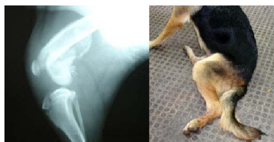
Fig.1 Mediolateral x-ray image of supracondylar metaphyseal femoral fracture in one-year old German shepherd dog

The young ages were the most commonly affected animals. In the present work, the ages of the fractured dogs were ranging between 4 months to 12 years old, whereas in cats from 4 weeks till 10 years old. Metaphyseal femoral and tibial fractures were common in puppies and kittens (4-18 months old). The body weights of the fractured dogs were ranging from 4 - 30 kg and that of cats from 1- 6 kg.