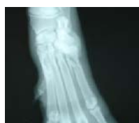
Fig. 7 Dorsopalmar x- ray image of complete oblique fracture of 5th metacarpal bone in a dog