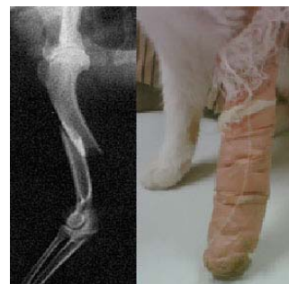
Fig. 5 Mediolateral x-ray image of complete overlapping diaphyseal humeral fracture in a cat

Fractured radius and ulna in dogs (Fig. 6) and cats represented (19 % and 14% respectively). Fractures of the metacarpal, (Fig. 7), lumbar vertebrae (Fig. 8), and mandible represented 3.4 % and 0 , 3.4 % and 3.5 % , 0 and 10% in dogs and cats respectively.