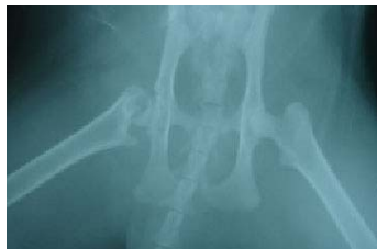
Fig. 2 Ventro-dorsal radiographic image of one year old tom cat with femoral neck fracture

were the most common types of traumatic fractures in cats, each one represented 25% and 21% respectively. The most common sites of the fractures in the femur were the shaft (diaphysis), distal metaphysis and supracondylar in dogs (Fig.1), whereas in cats, femur neck (Fig. 2), distal metaphysis and diaphysis (Fig. 3).