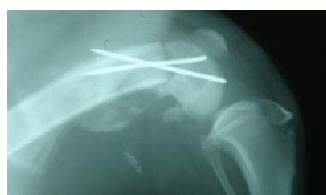
Fig. 9 Mediolateral radiographic image of the supracondylar femoral fracture treated with cross pin

External coaptation with cast and adhesive tape bandages gave good results in fractured radius and ulna (Fig. 13) as well as fractured metacarpal bones.