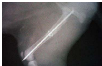
Fig. 14 Mediolateral radiographic image of 6-months old dog with complete femoral fracture treated with intramedullary pin and circlage wire

After 3-5 months complete remodeling occurred in operated cases. The fractured humerus, radius and ulna were illustrated in the same table. Femoral neck fractures in young cats were treated by femoral head resection.