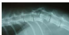
Fig. 8 Lateral x- ray image of an oblique displaced fracture of dorsal spinous process of the 1st lumbar vertebra in 6 months old German shepherd dog

External coaptation with cast and adhesive tape bandages gave good results in fractured radius and ulna (Fig. 13) as well as fractured metacarpal bones.