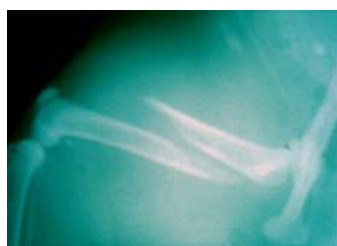
Fig. 3 Medio-lateral x-ray image of complete wedged diaphyseal femoral fracture in a 6-months old Siamese queen

The most common types of fractures met with in the present work were complete simple transverse or oblique and comminuted. Tibial fractures in dogs and cats (Fig. 4) represented 21.5 % and 10% respectively, whereas humeral fractures (Fig. 5) were represented as 7.9% and 14% in dogs and cats respectively. Humeral condylar fractures were most often seen in puppies 4 to 6 months old. The vast majority involved the lateral condyle.