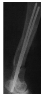
Fig. 10 An x- ray image of complete femoral diaphyseal fracture of a dog treated with stack pins