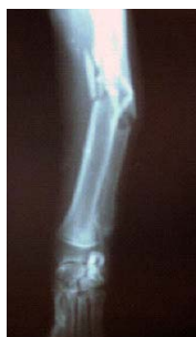
Fig. 6 Dorsoventral x- ray image of complete comminuted fracture of radius and ulna in a dog

The traumatic supra – condylar femoral fractures in dogs were repaired successfully using cross- pin technique (Fig. 9). Stack pins provided effective stabilization to complete oblique femoral fracture (Fig. 10), whereas use of Intramedullary pinning technique and cerclage wire was effective in tibial fractures (Fig.11) and in humeral fractures (Fig.12).