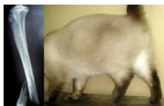
Fig. 4 Medio-lateral x-ray image of complete wedged diaphyseal tibial fracture in a 2 year old cat

The most common types of fractures met with in the present work were complete simple transverse or oblique and comminuted. Tibial fractures in dogs and cats (Fig. 4) represented 21.5 % and 10% respectively, whereas humeral fractures (Fig. 5) were represented as 7.9% and 14% in dogs and cats respectively. Humeral condylar fractures were most often seen in puppies 4 to 6 months old. The vast majority involved the lateral condyle.