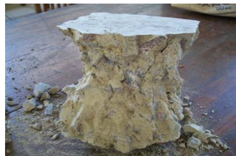
(a) Fractured experimental specimen